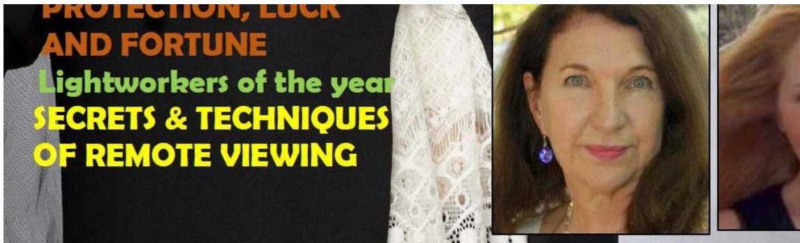
Sample a few pages from American Psychic & Medium Magazine, May 2017